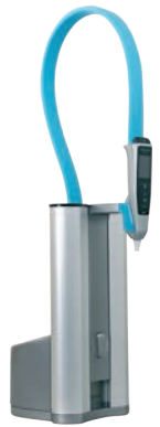
PURELAB flex 1