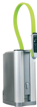
PURELAB flex 3&4