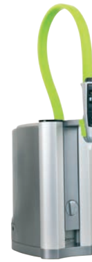
PURELAB flex 3&4