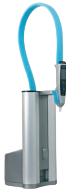
PURELAB flex 2